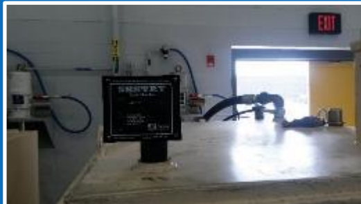
Electronic Monitoring Devices