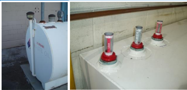
Detect Leaks in Double Wall Tanks